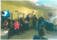
Film Editing Workshops

On Sunday 21 st December @ 6.30pm why not join us in our special Christmas Event. There will be Singing, Live theatre performances and a chance to learn more about the Project!