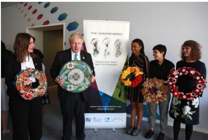
Image: Foreign Secretary holding the Hackney Mosaic Group wreath with members of the Big Ideas team proudly carrying four further community wreaths made by (left to right) Friends of Redcar Cemetery, Fenwick Parish Church, Age UK Sandwell and Kirkbymoorside Primary School.

On Friday 20 April, five of the Unremembered wreaths were presented to the Foreign Secretary and Commonwealth Foreign Ministers at a lunchtime reception as part of the Commonwealth Heads of Government meeting. One wreath made in mosaic by Hackney Mosaic Group in London was presented to the Foreign Secretary. The others were shown to many delegates and diplomats including the International Minister for the Commonwealth Human Rights Initiative, the Minister of National Security for Bermuda and the High Commissioner of Barbados. The four further wreaths shared with delegates last Friday were made by Kirkbymoorside Primary School, Age UK Sandwell, Friends of Redcar Cemetery, and Fenwick Parish Church.